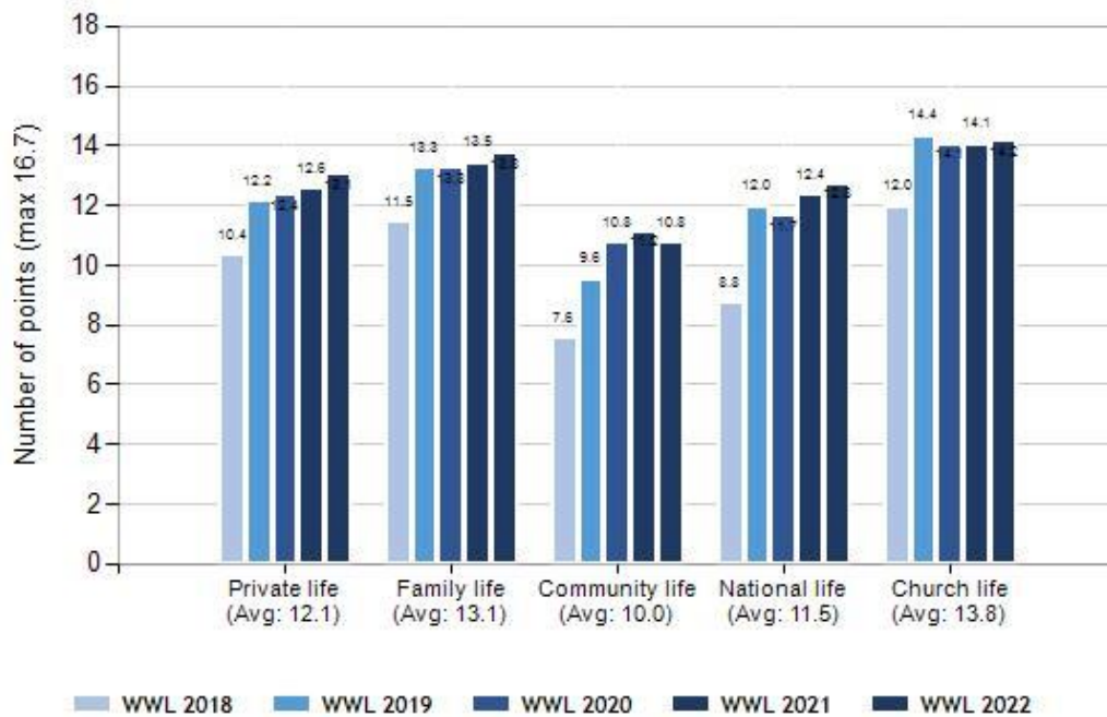
WWL 2018 - WWL 2022 Persecution Pattern for Morocco (Spheres of life)