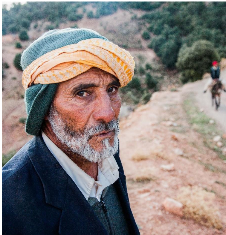
Man from Morocco (c) IMB