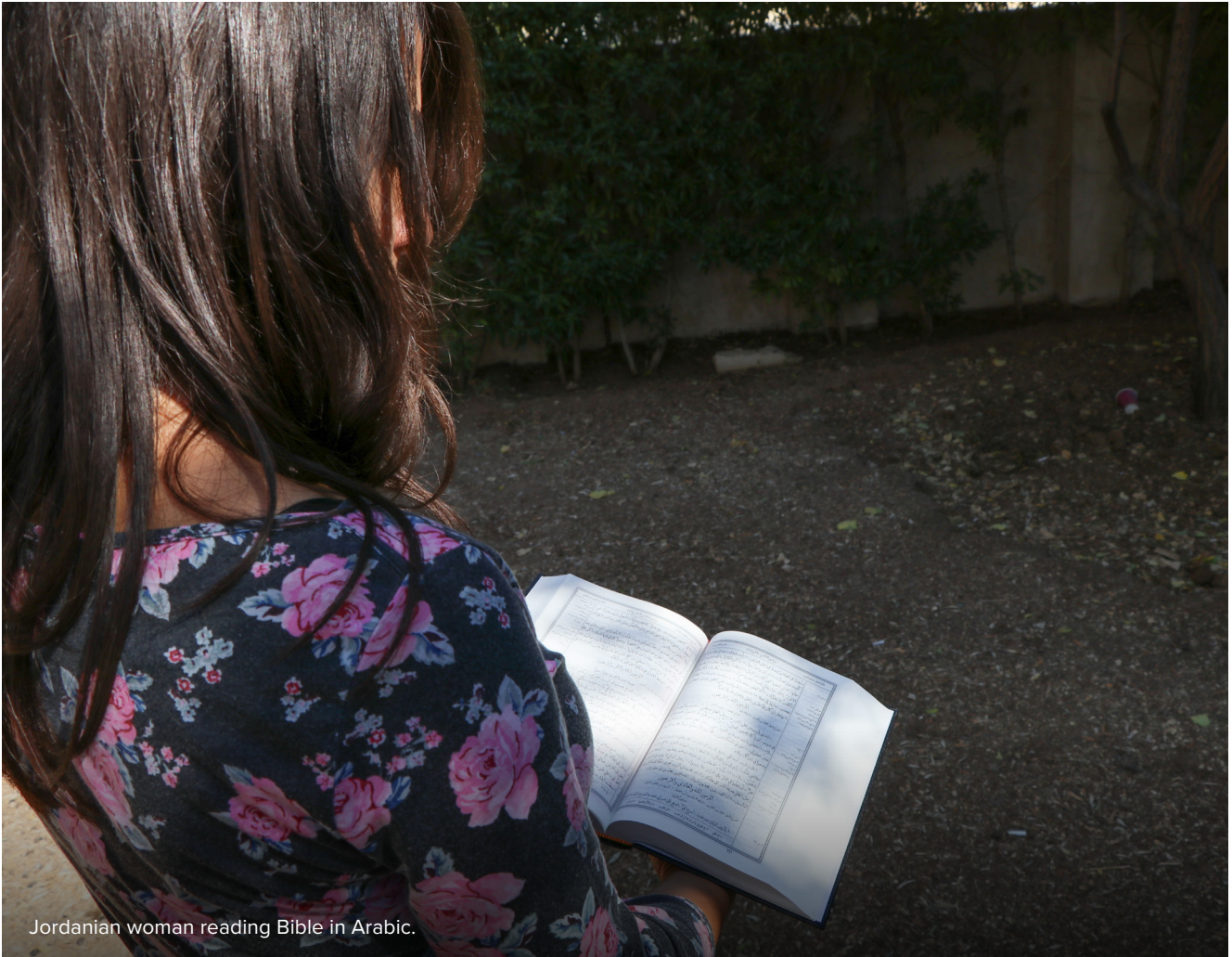
Jordanian woman reading Bible in Arabic.

Jordan's systems tend to discriminate against communities belonging to non-Sunni dimensions, for instance Shiites, Baha'i, Druze, Buddhists, Hindus, Iraqi Mandaean, and Jehovah's Witnesses, all of which are not officially recognized. It is reportedly harder for a Sunni to convert to Shiite Islam than to convert to Christianity.