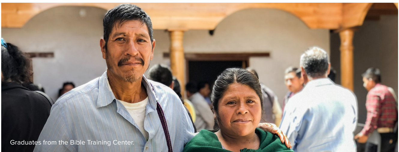
Graduates from the Bible Training Center.