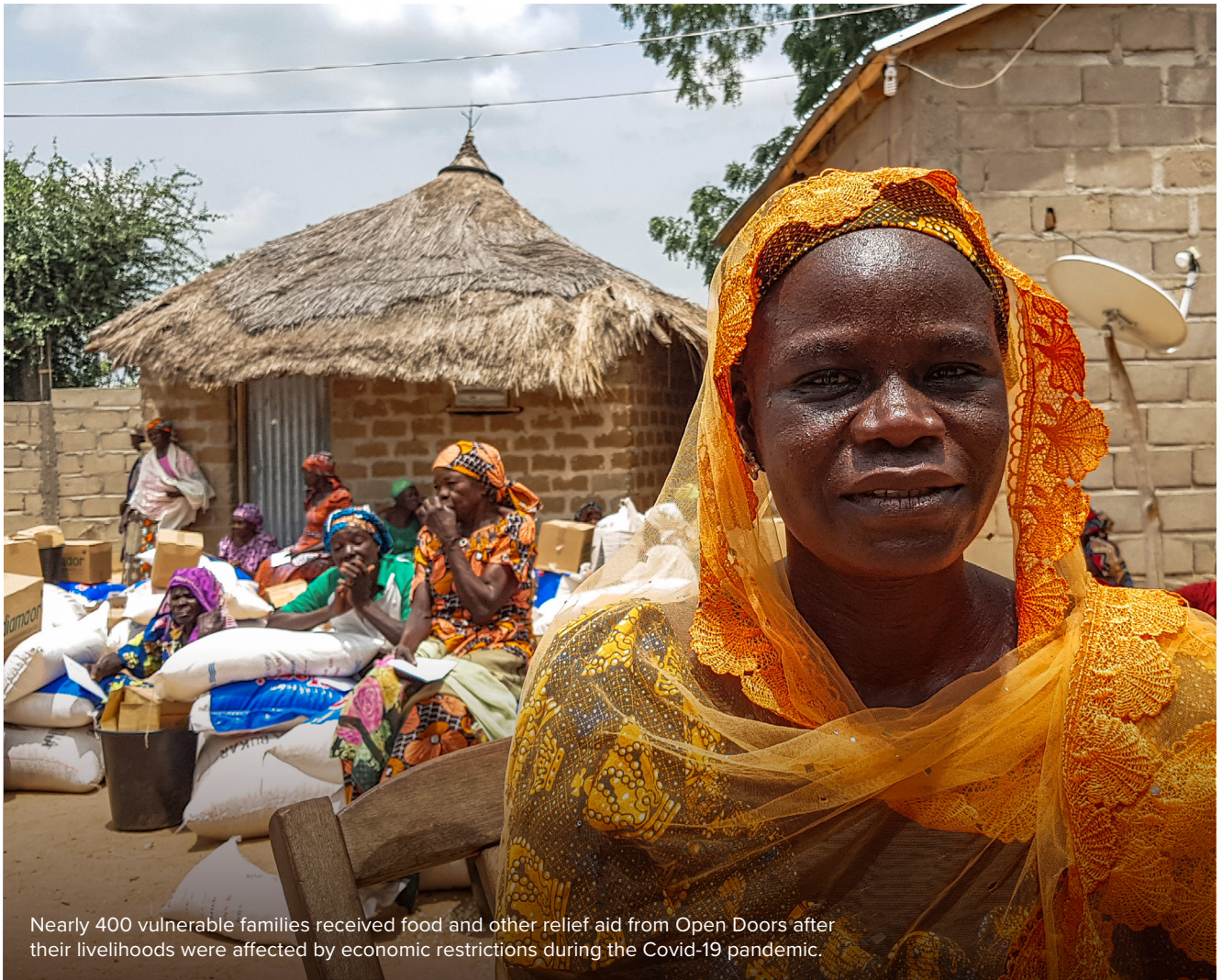
Nearly 400 vulnerable families received food and other relief aid from Open Doors after their livelihoods were affected by economic restrictions during the Covid-19 pandemic.

Any religious groups that do not openly support the government face violations. In areas where Christians are the majority, Muslims are ostracized because the community sees them as likely Boko Haram sympathizers.