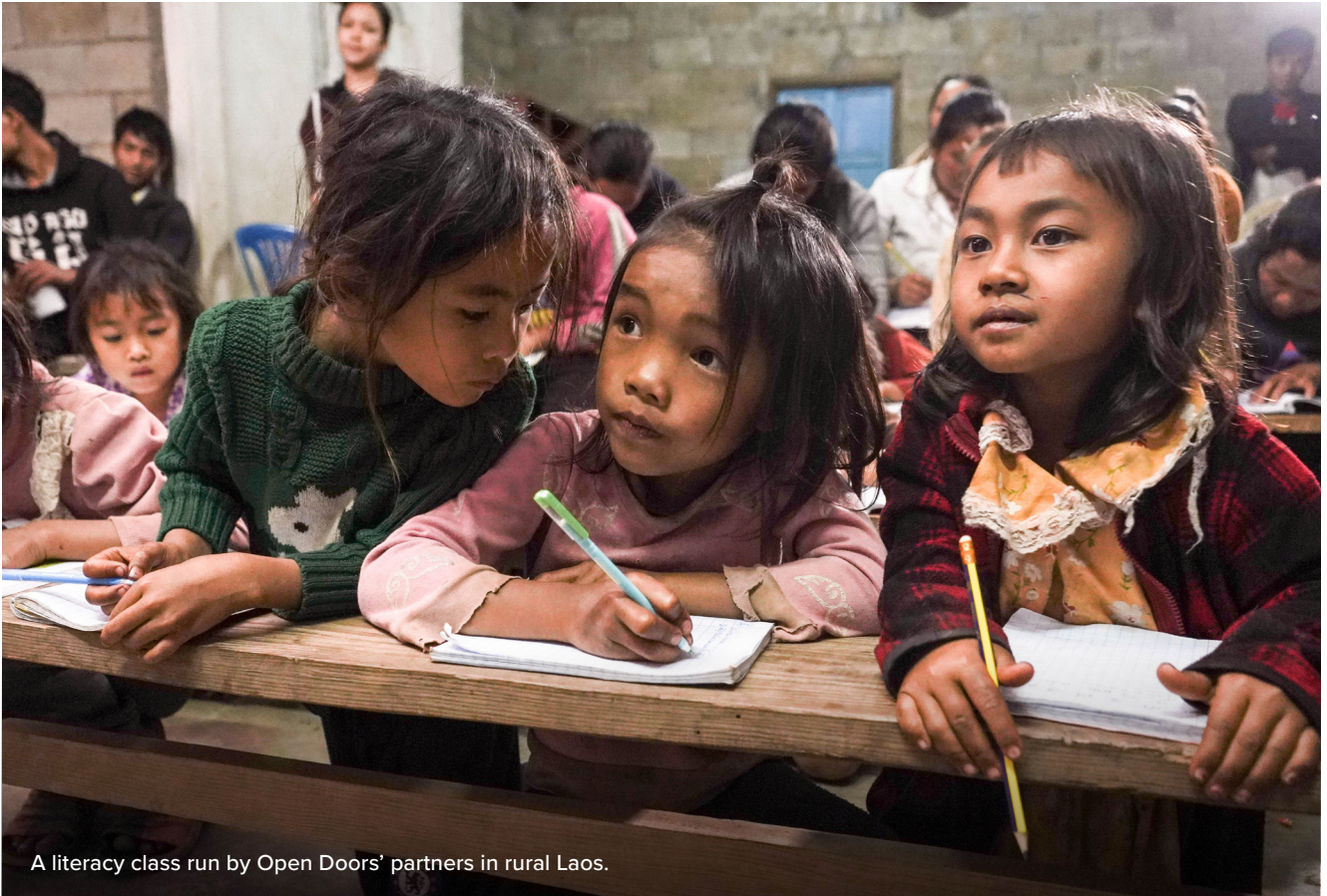
A literacy class run by Open Doors' partners in rural Laos.

Buddhists outside of mainstream Buddhist teaching sometimes face problems when registering monks. Among the ethnic communities, the Hmong (often animists or Christians) in some areas have faced the greatest oppression from the government. Muslims, Hindus and adherents of Baha'i also form tiny minorities in the country, which face pressure from Communist state authorities.