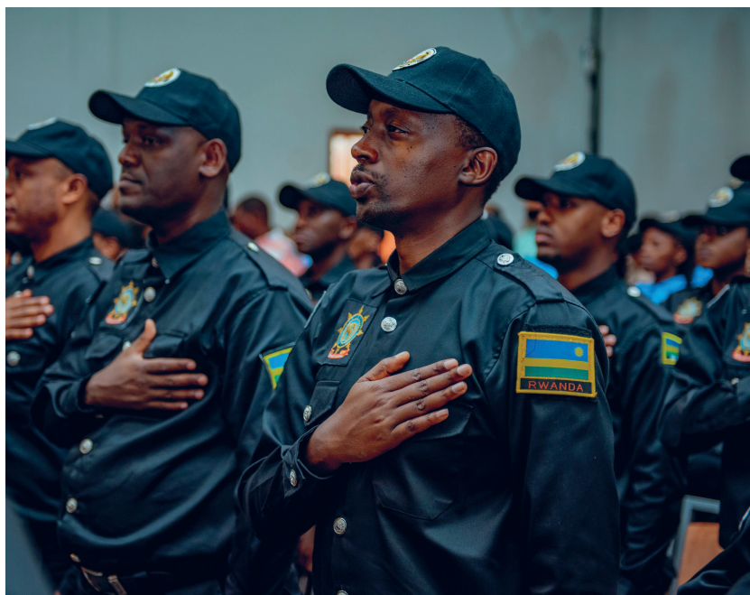
Police officers, Rwanda (illustrative image)

Laws governing the ways that religious communities acquire legal personality to form an association, constitute limitations on the organizational manifestations of religion or belief. 27 Any such limitation must be in accordance with the stringent standards set forth in Articles 18 and 21 ICCPR, and elaborated in General Comments Nos. 22 28 and 37. 29 For example, the protection of "public health and safety" as a restriction may be imposed where there is an outbreak of an infectious disease and gatherings could be dangerous. According to Open Doors sources, local bureaucrats in Rwanda, for corruption related reasons, intentionally delay the process to inspect closed churches