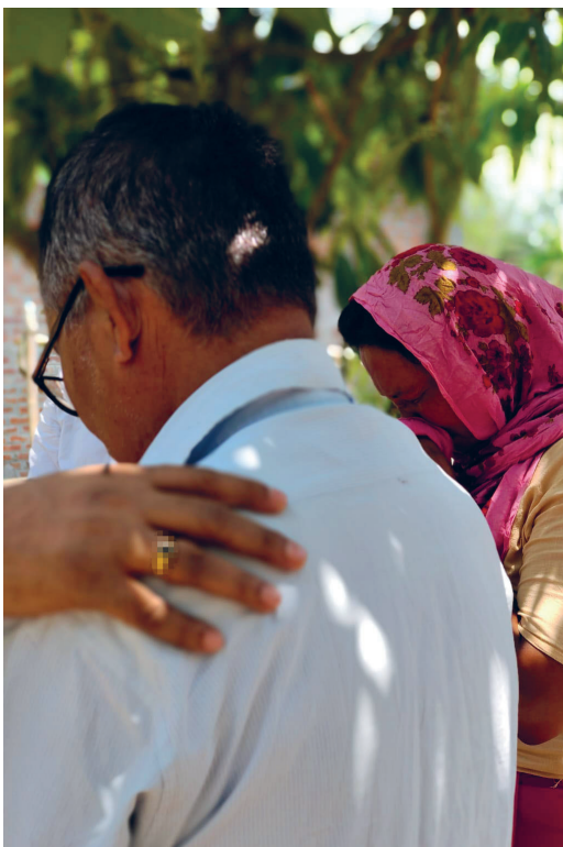
During violence in Manipur earlier this year, many churches, Christian houses and properties were burnt down, destroyed and demolished by pro-Hindutva groups