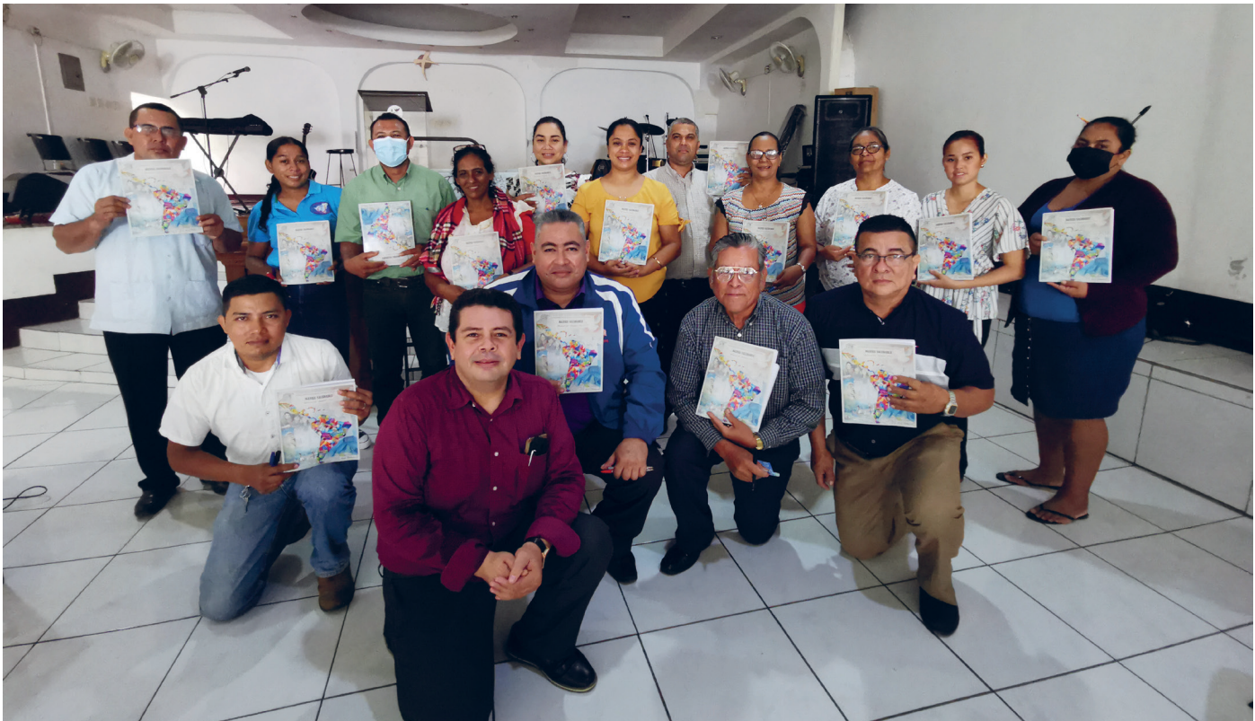
In November 2022, training on discipleship was held for a total of 60 pastors in Bilwi and Leon, Nicaragua