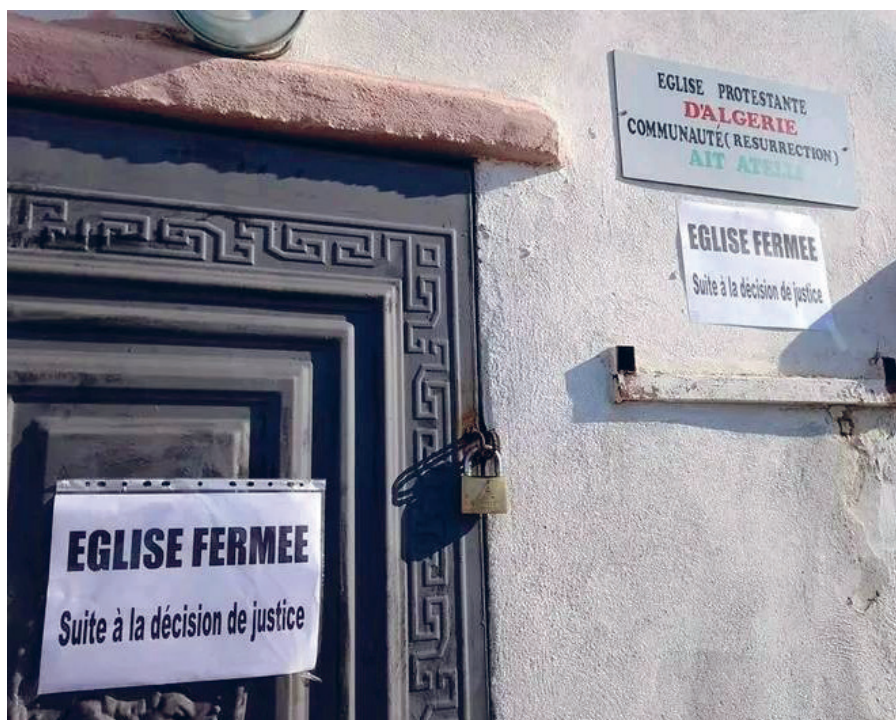
A church closed by the Algerian authorities

“States should ensure that worship places, sites, and shrines are also protected from attacks by non-state actors, not just state-led attacks. This protection also extends to establishments that are important to a religion or belief, such as community centers, cemeteries, and monasteries.”