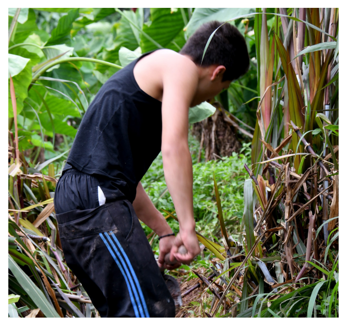
Photo: A teenage boy farming in a children's centre for children of pastors and teachers threatened in the civil war.

Serious violations to freedom of religion or belief and other fundamental rights also occur within indigenous communities in Colombia. Indigenous territories are recognized as territorial entities according to the Colombian Constitution and are governed by councils formed and regulated according to the customs of their communities. Such councils can adopt legislative acts, economic policies, budgets, ensure public order and implement their own justice system.<sup>13</sup> However, according to Article 246 of the Constitution, their territorial jurisdiction cannot enact anything contrary