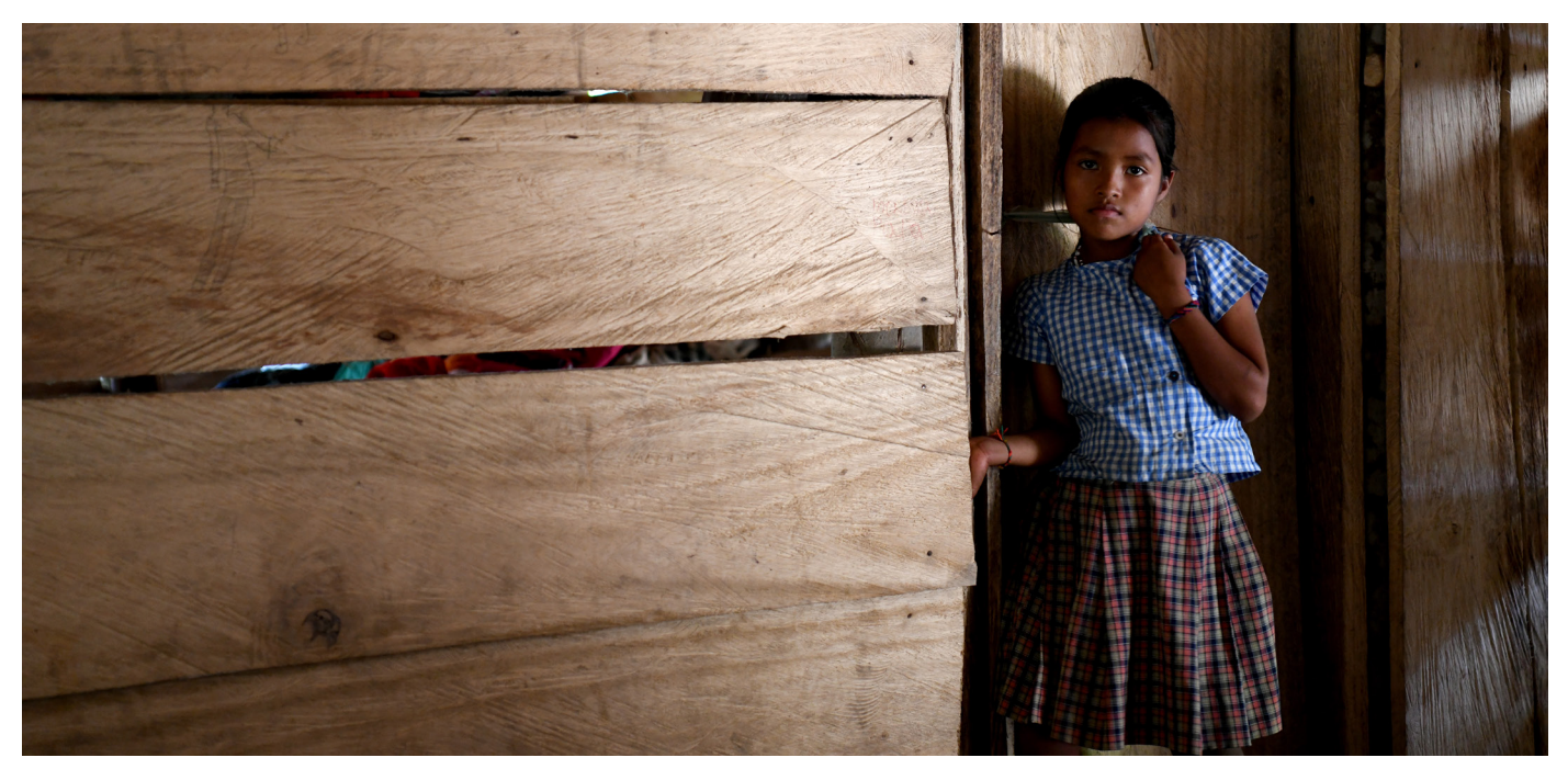
Photo: An indigenous Christian girl from the mountains of northern Colombia.

<sup>9</sup> "Colombia: Assignment Report", Ibid .