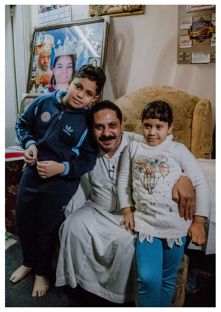
Photo: A family that lost their wife/mother in the Palm Sunday bombing on St Marks Coptic Orthodox church, Alexandria, 2017.

The aforementioned Law 80/2016 replaced the previous vague legal framework on church construction and renovation with one single law, and it has a number of positive aspects that should be noticed, such as localizing the approval or permits by putting governors in charge of approving permits rather than the president,