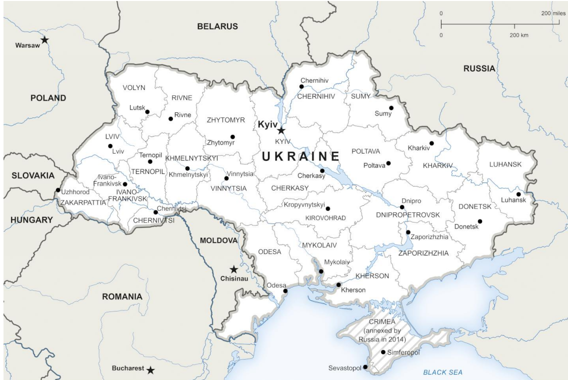
Luhansk and Donetsk provinces are often referred to as the Donbas Region.